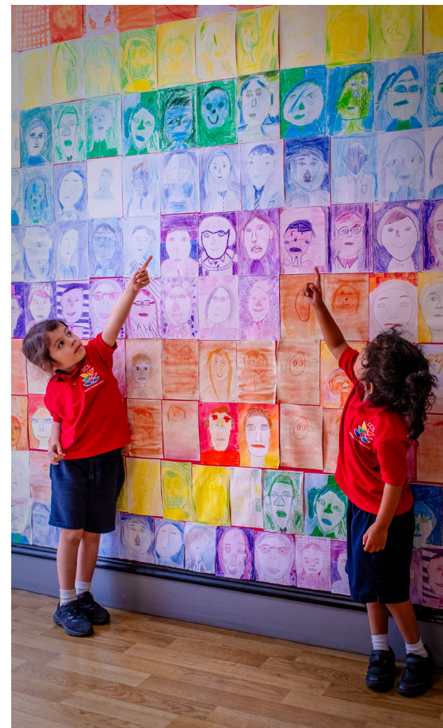
'Who we are' colourful self portraits proudly on display

We teach and model values that have stood the test of time. This helps us establish a loving atmosphere and close community within the school. All our class teachers are committed Christians, and every area of school life is informed by and built on our Christian foundation. We are delighted to welcome children from any background, regardless of religion or belief.